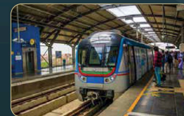
Metro LB Nagar 55mins

Discover a tranquil experience where everything from well curated plots & sophisticated facilities rejuvenate the mind & soul. Each plot offers the convenience & serene comfort.