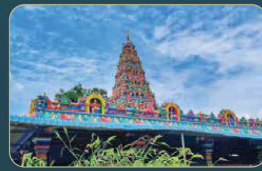
Maisigandi Temple 5mins