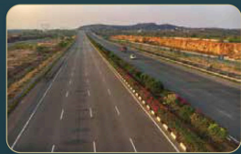
ORR (Tukkuguda) 20mins