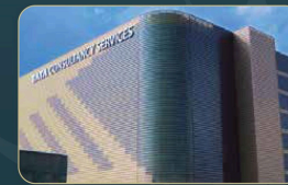
TCS Adibatla 30mins