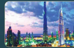
Fab City 15mins