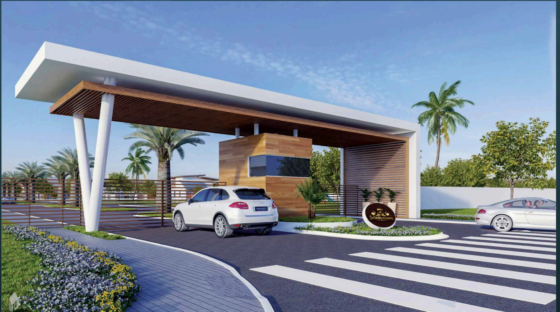
The entrance plaza of SRINIVASAM